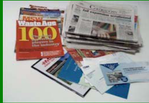
Mix called "Newspaper Plus" or "#7 ONP"

The drop-off site has one 40-yard container to deposit the "Newspaper Plus" materials into.