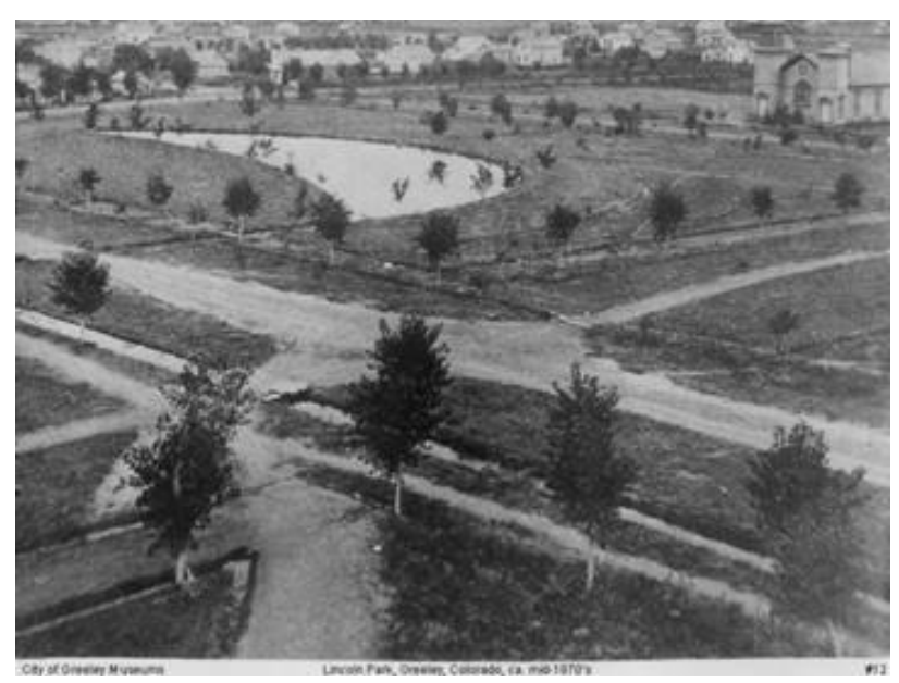
Figure 3 . Lincoln Park in 1870; an early example of landscape irrigation in Greeley.