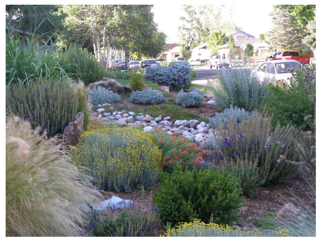
Figure 8. A water efficient landscape design can be beautiful.

While the design, installation, and maintenance of a bluegrass lawn can be a relatively simple task, the design, installation, and maintenance of a water-efficient landscape requires more thought and skill. The interaction of plants, soil, water, irrigation systems, soil texture, irrigation systems, climate and weather, and people are complex and changing. One frequently mentioned reason for not following water efficient landscape practices is a lack of knowledge of what plant materials and other practices are likely to be successful, and how much or how little water is required for plant survival. It is therefore recommended that the City support and coordinate with other organizations to provide training, and create training programs for landscape professionals and trades people, residents, and property managers to effectively address the need to conserve landscape irrigation water. Some or all of these training programs could be offered regionally rather than just locally.