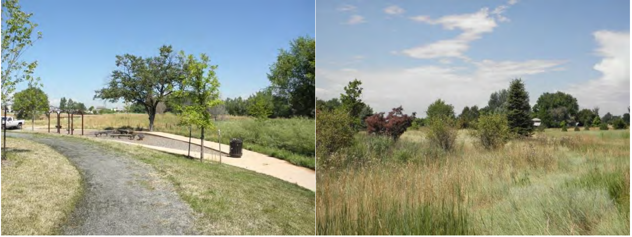
Figure 6 & 7. Homestead Park (left) and JB Jones Park have been designed to use water efficiently.

The Parks and Forestry Divisions have a significant role in landscape management and irrigation, based on upon customer services and demand.