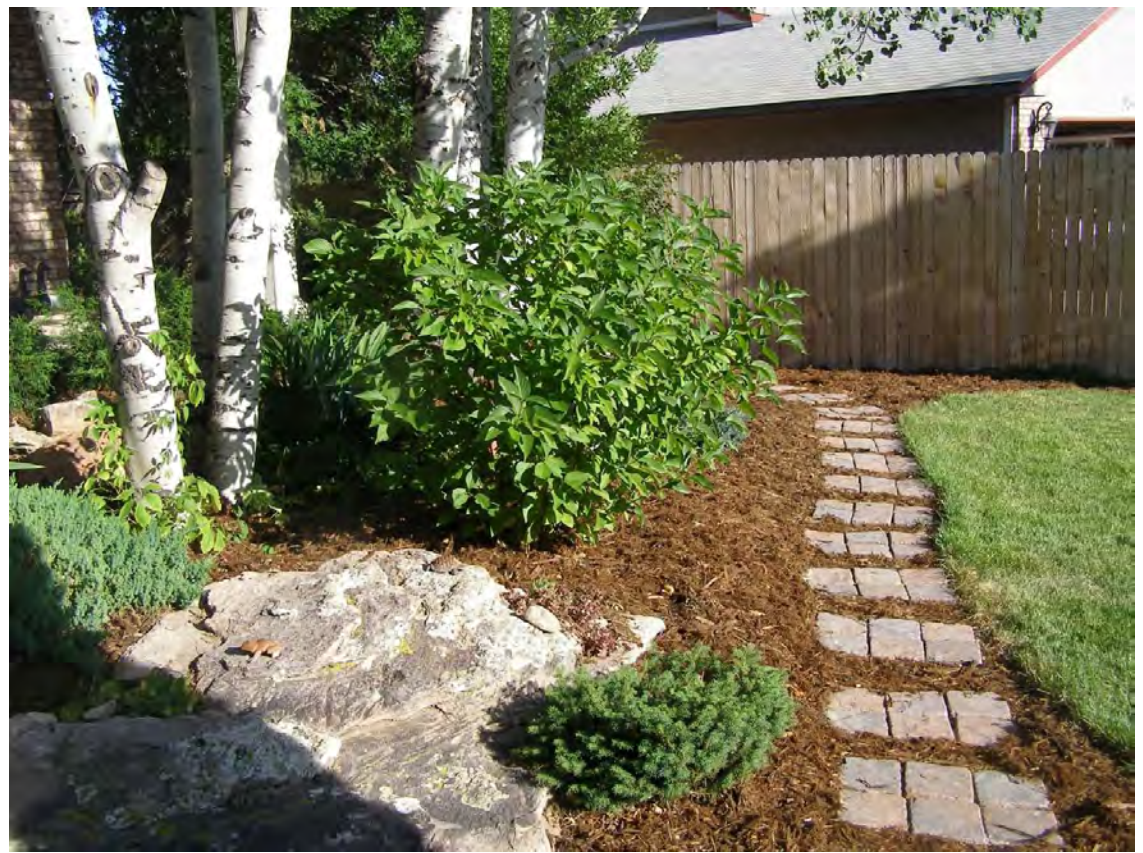
Figure 9. Water efficient landscape designs can use many plants already used in Greeley and fit in any program.

Action 2.4.4 Teach and publicize at every opportunity the seven principles of Xeriscaping<sup>®</sup> developed by Denver Water and listed below. Modifications to reflect Greeley policy are in brackets. These principles are as follows (Greeley, City of, 2015):