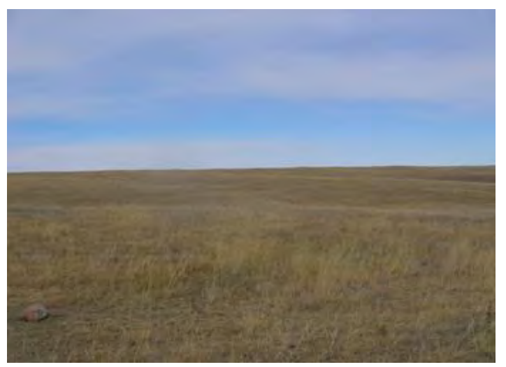
Figure 2. The native landscape of Greeley is a short grass steppe.