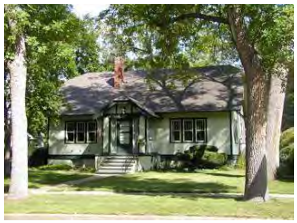
Figure 4 . Trees can reduce the temperature of urban areas by 10° F on hot summer days with shade and evapotranspiration.

Energy Conservation. Effective landscaping can reduce summer cooling bills by 50% or more and winter heating bills by up to 25%. Reduction of winter heat loss is caused by the reduction of wind velocities near the building. This, in turn, reduces the pressure difference between the inside and outside of the building, leading to a reduction of heat loss by as much as 50% on cold windy days. The reduction in summer cooling demand is caused by shading of the building, leading to a reduction in solar radiation reaching windows and walls. Through the use of deciduous trees on the south sides of buildings, solar radiation can still reach buildings during the winter, warming them when the leaves are gone, and buildings can be shaded in the summer, reducing heat gain by solar radiation. (Walker, 2009)