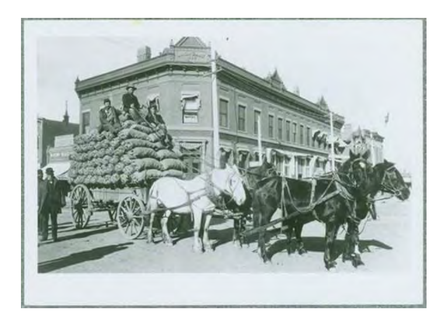
Figure 1. Early agricultural crops being delivered to Greeley.

Since Greeley's founding, agriculture has been an important part of its economy. Weld County is ninth in agricultural production value in the U. S. at $1.9 billion dollars. It is the most agriculturally productive county outside of California (Bureau of the Census). Most of this production is based on converting forage from irrigated cropland to animal protein and processing it.