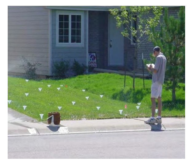
Figure 10. Periodic irrigation audits are an important part of irrigation maintenance.