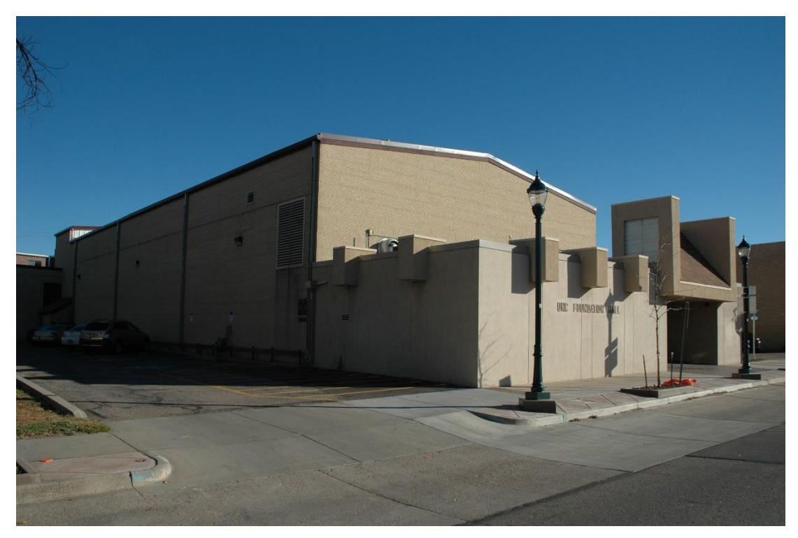
CD 2, Image 42, View to SE of façade (west) and north side