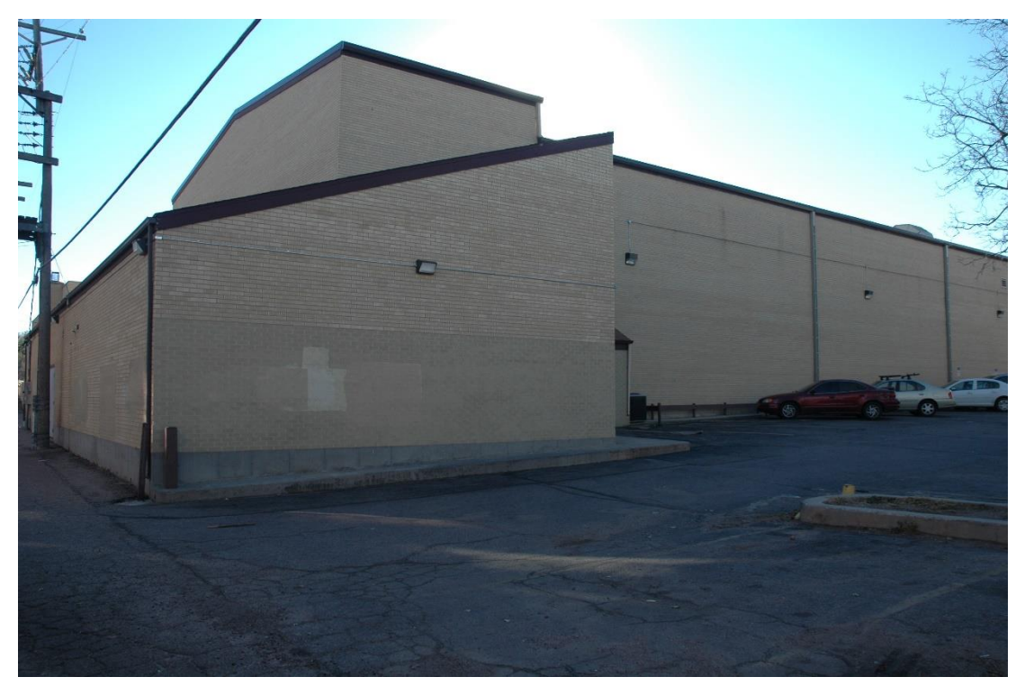
CD 2, Image 46, View to SSW of rear (east) and of north side