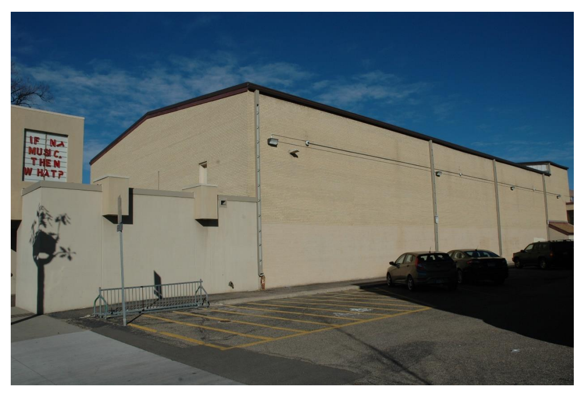
CD 2, Image 44, View to NE of south side