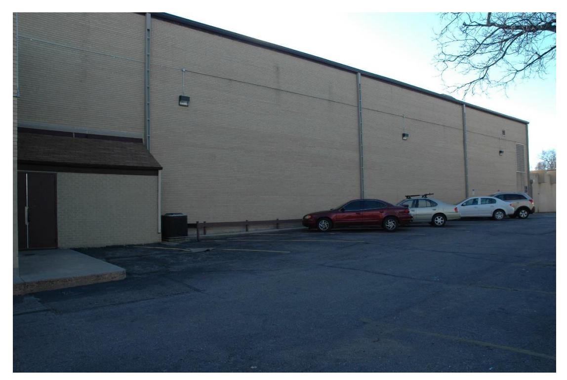
CD 2, Image 47, View to SW of north side