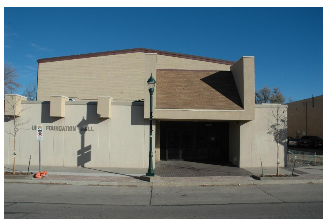
CD 2, Image 43, View to east of façade (west)