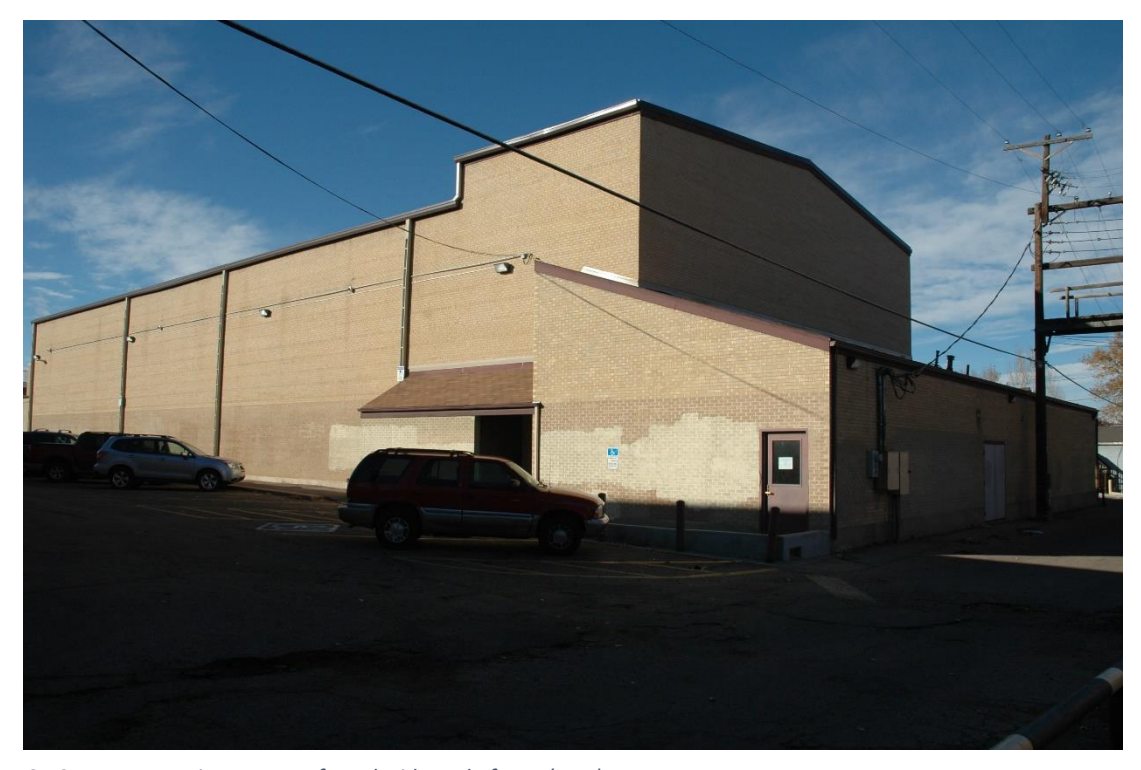
CD 2, Image 45, View to NW of south side and of rear (east)