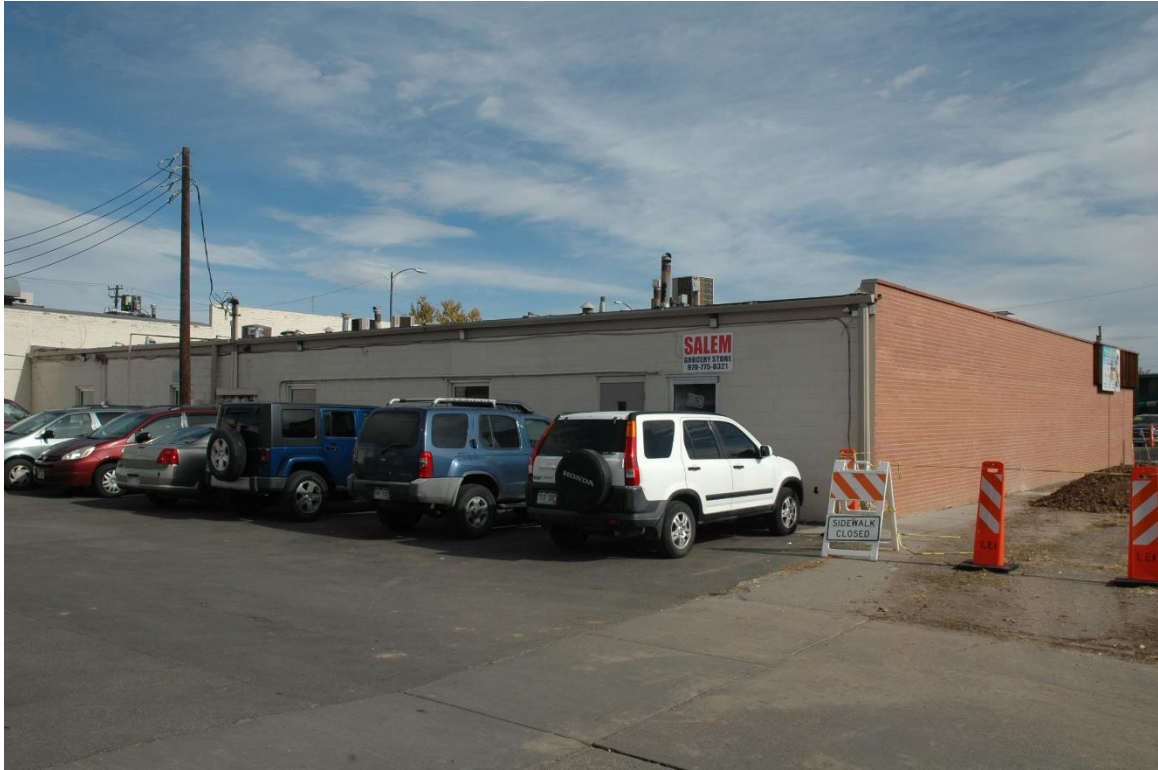
CD 1, Image 54, View to NE of west (rear) and south side