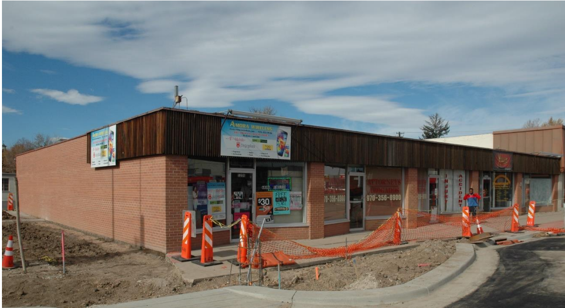
CD 1, Image 56, View to NW of façade (east) and south side