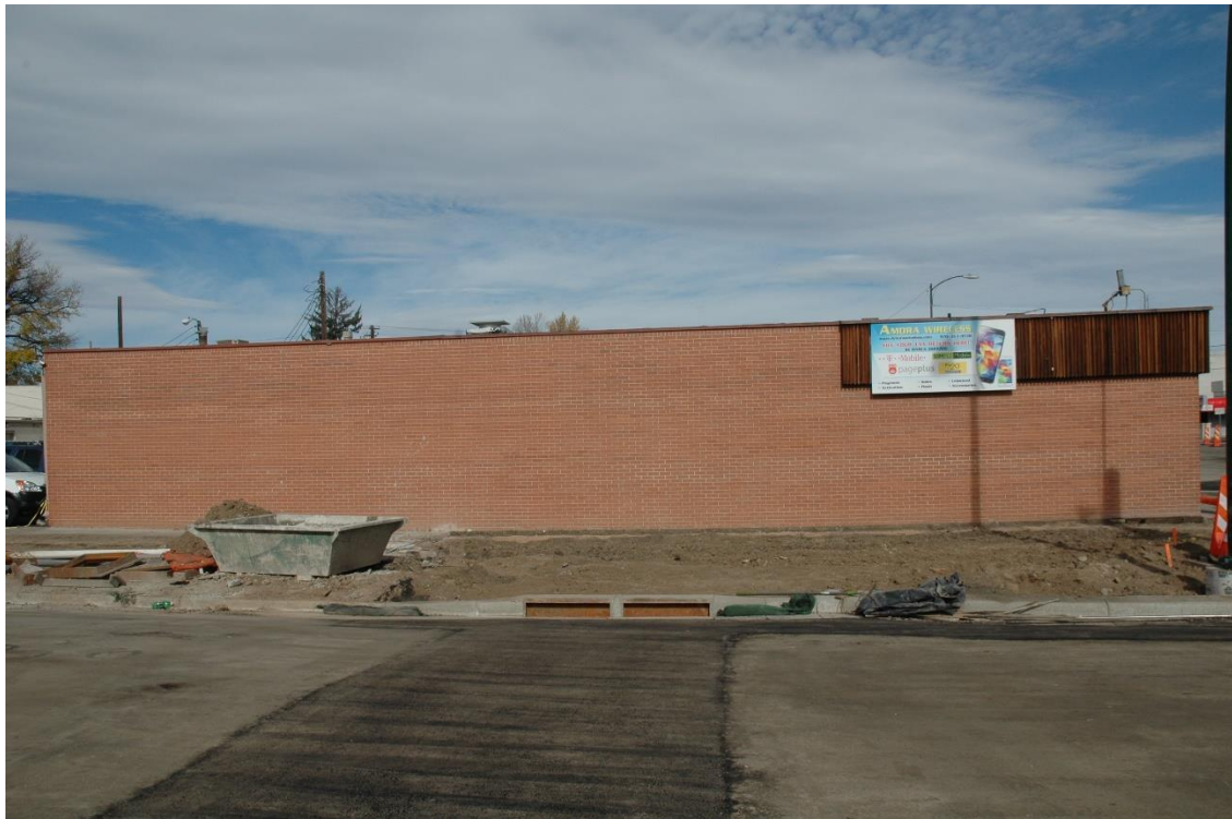
CD 1, Image 55, View to north of south side