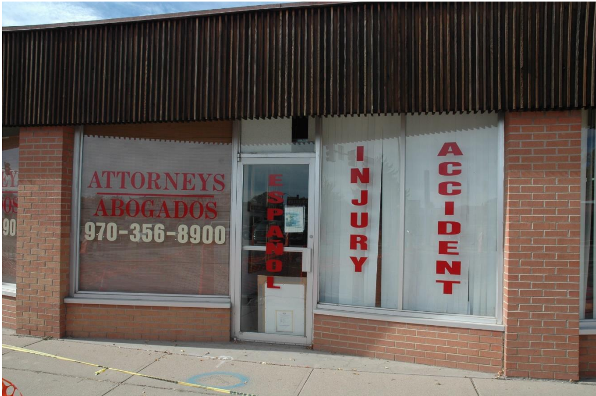
CD 1, Image 58, View to west of Entry on Façade (east)