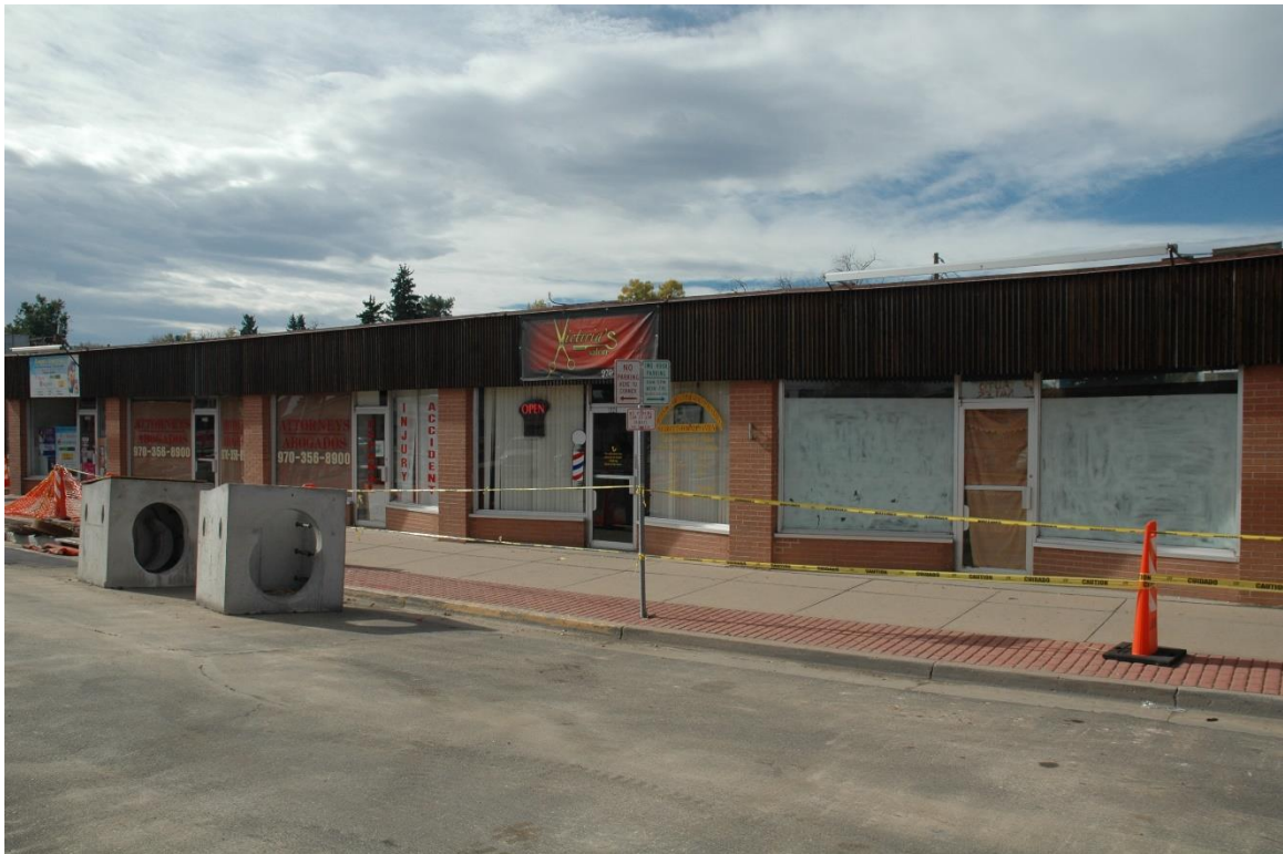
CD 1, Image 57, View to SW of façade (east)